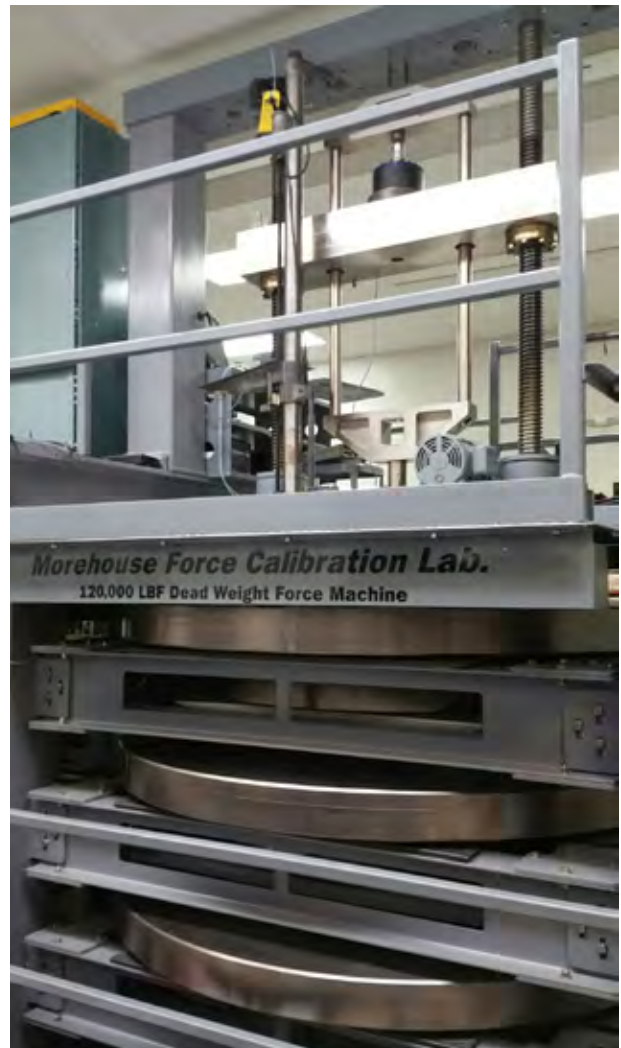
Figure 3. View of Deadweight Machine