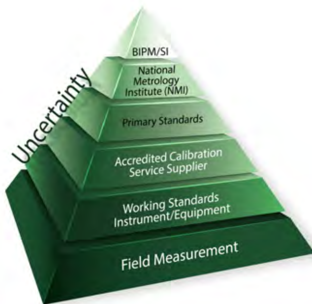
Figure 1. Measurement Uncertainty Pyramid

Henry Zumbrun and Alireza Zeinali Morehouse Instruments