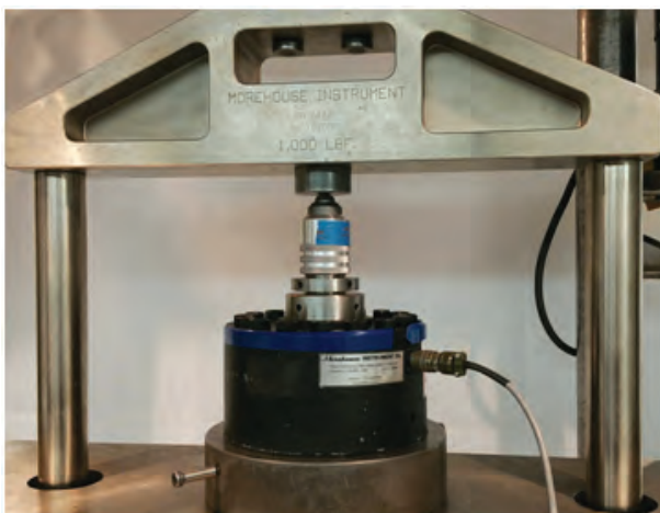
Figure 2. 445 kN (100k lbf) Load Cell in Deadweight Machine Being Calibrated

The environment was controlled by better than +/- 1.0 °C [3], while the stability of the weights was calculated using historical values for the material and years of wear history from our other deadweight machines. The resolution of the weights was zero since they are physical standards, and