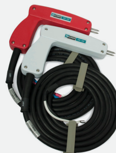
HTP-100 Pistol Grip Probes