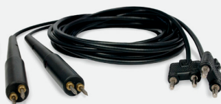
SSP-10 Kelvin Probe with Stainless Steel Pins