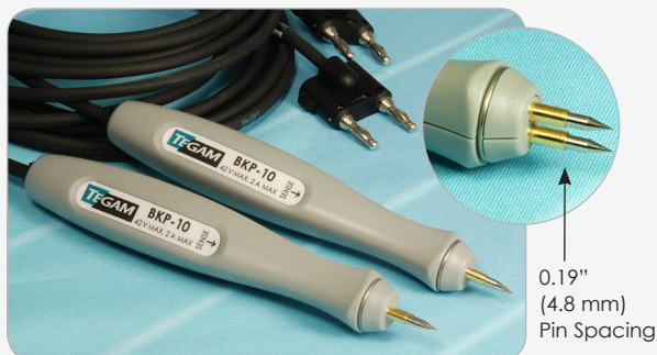
BKP-10 Probe Set with "B" Style Pins Installed