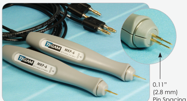
MKP-6 Probe Set with "B" Style Pins Installed