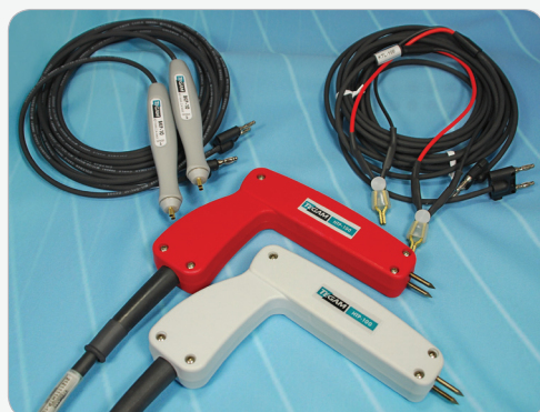
BKP-10 HTP-100 Pistol Grip KTL-100