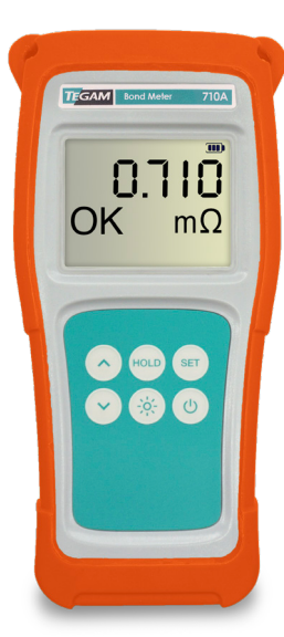
700–915 SureGrip™ Cover