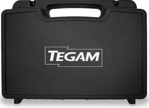
700–911 Foam-Filled Hard Carry Case