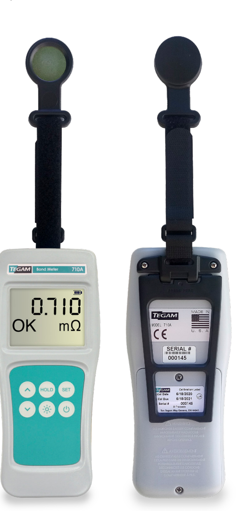
700–910 or 700–912 Tilt Stand / Magnetic / Hanger