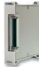
Figure 4. TB-2715 I/O Terminal Block

TB-2715 .....778242-01 Dimensions – 8.43 by 10.41 by 2.03 cm (3.32 by 4.1 by 0.8 in.)