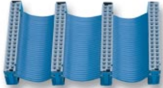
Figure 7. RTSI Bus Cable