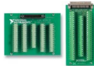
Figure 6. CB-68LP and CB-68LPR I/O Connector Blocks

CB-68LPR .....777145-02 Dimensions – 7.62 by 16.19 cm (3.00 by 6.36 in.)