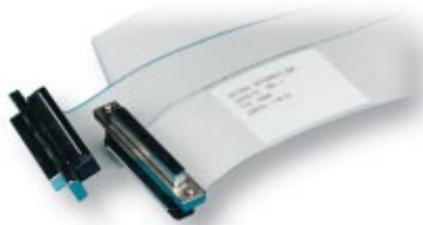
Figure 10. R6868 Ribbon I/O Cable