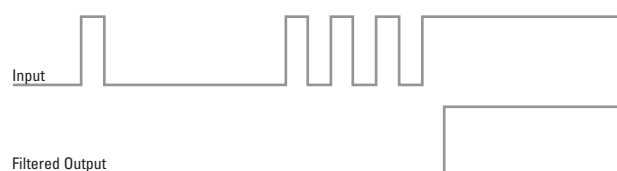
Figure 2. Debouncing and Glitch Removal

Calibration is a key component of any measurement solution. In the case of counter/timers, timebase calibration ensures that the frequency and time measurements are accurate. Calibration certificates enclosed with the National Instruments counter/timers and periodic calibration satisfy your ISO-9000 requirements, certifying that your instrument has been properly calibrated. See page 21 for more information.