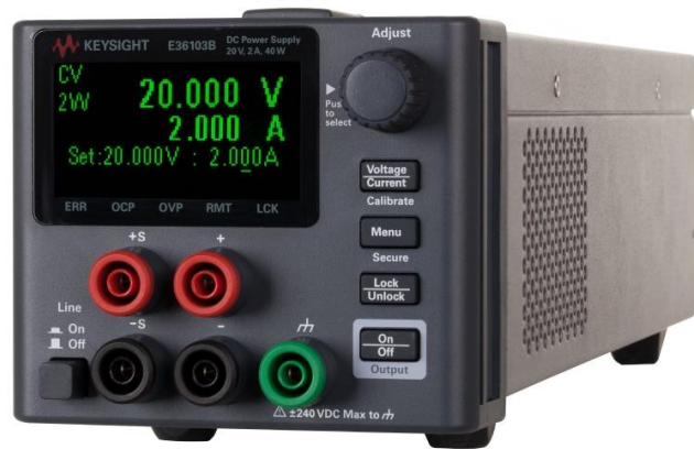
Option J01 recessed binding posts

Do you need to convert the power supply for different mains power? The two switches on the bottom of the instrument make it straightforward. See the product manual for details.