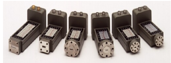
Agilent 11970 series external mixers