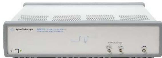
Figure 2. Agilent N4916A De-emphasis Signal Converter