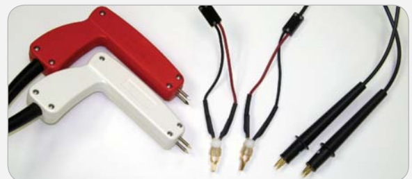
HTP-100 Pistol Grip KTL-100 BCP-10