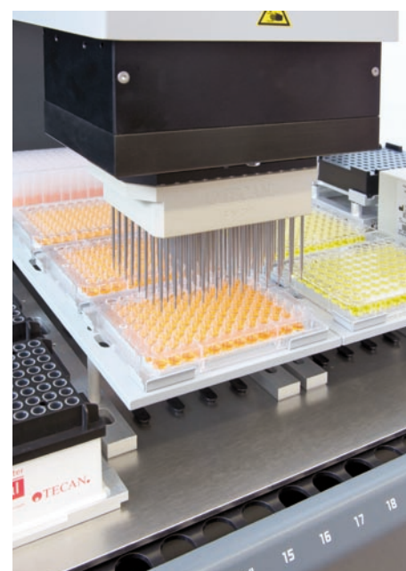
Washable fixed tips reduce running costs.

Tecan's MultiChannel Arm has the flexibility to work with both disposable and washable tips, which can be automatically exchanged during a run. This means you can use washable tips when appropriate, for example while pipetting reagent, and then switch to disposable tips whenever your protocol demands a new tip.