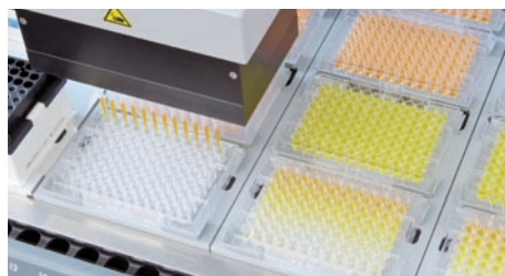
Pipetting with a single row of 12 disposable tips e.g. for serial dilutions.

The 96-channel head is able to pick up just one column or row of disposable tips, subsequently working as either an 8- or 12-channel pipette, enabling pipetting into a single column or row of a 96-well microplate; it can even use just one disposable tip if required, for example in a hit picking application. For applications such as IC 50 assays, 8 or 12 channels can be used to perform a serial dilution over a 96-well