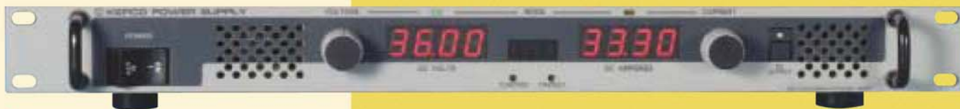
MODEL KLP 75-33-1200 0-75V@16A TO 0-36V@33A