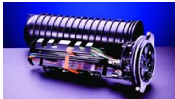
SCF-6C22-01-72 Fiber Splice Closure | Photo SHD38