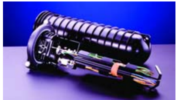
SCF-4C18-01-36 Fiber Splice Closure | Photo SHD46